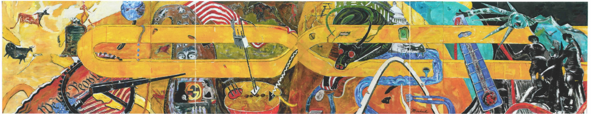
“Resiliency” 2013 (24' x 5')

“ I painted “Resiliency” because I wanted to make a statement about the quality of being able to spring back after an adversity...may be more important to future generations than to us. Not addressing the economic gap, concentration of wealth, terrorism and climate change now makes the future a more challenges place for everyone.”