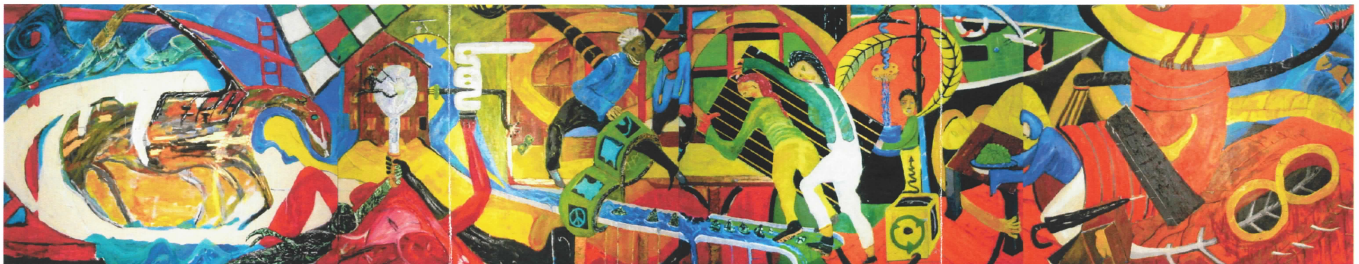
“Sustainability” 2012 (24' x 5')

“ I painted “Resiliency” because I wanted to make a statement about the quality of being able to spring back after an adversity...may be more important to future generations than to us. Not addressing the economic gap, concentration of wealth, terrorism and climate change now makes the future a more challenges place for everyone.”